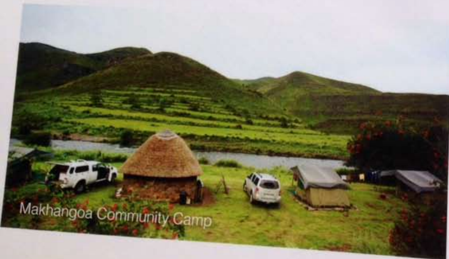
Makhangoa Community Camp

Diesel and petrol can be found in most towns, but you may be forced to purchase expensive fuel that's sold out of a jerrycan. Luckily, distances in Lesotho aren't vast, so if you fill up in Butha-Buthe you should be fine throughout your tour. Otherwise, there's a relatively formal fuel station in Thaba-Tseka.